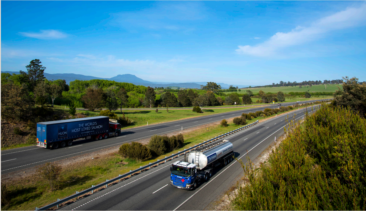
Overlooking the Bass Highway (two lane) at Westbury