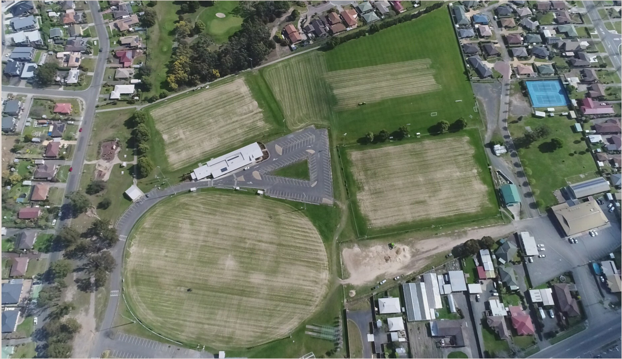
Prospect Vale Park from above via drone.