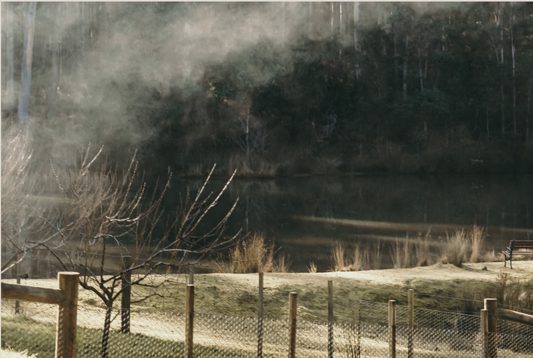
A misty winters morning over a dam in Reedy Marsh