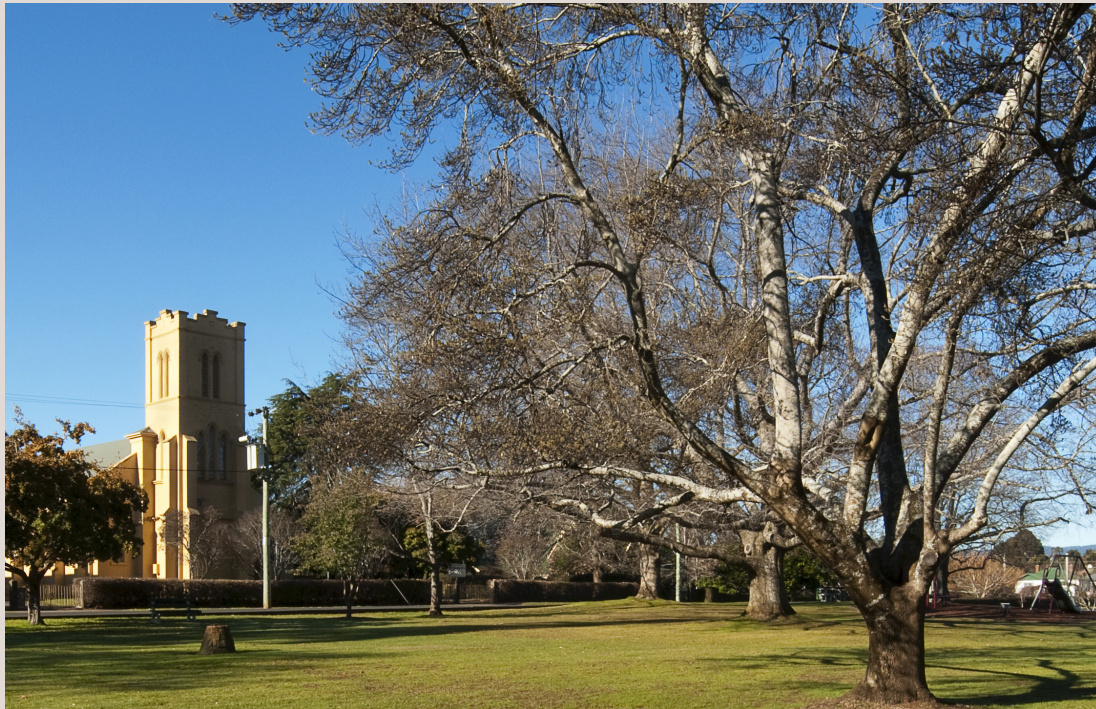
Looking over Westbury Village Green toward St Andrew's Church, a favourite for locals and visitors alike on a bright, sunny day.