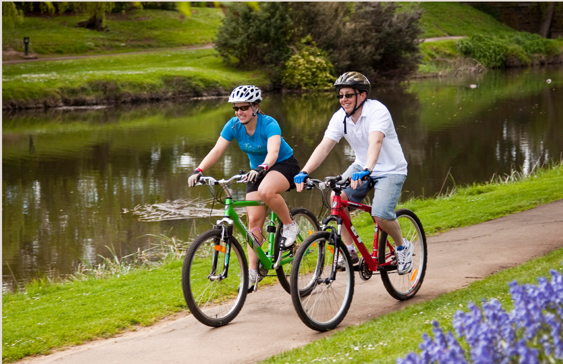
Cycling along Deloraine's Riverside Reserve Trail