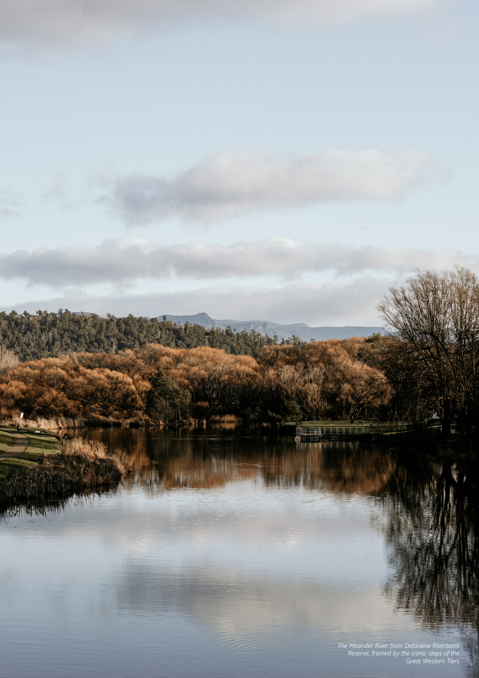
The Meander River from Deloraine Riverbank Reserve, framed by the iconic steps of the Great Western Tiers