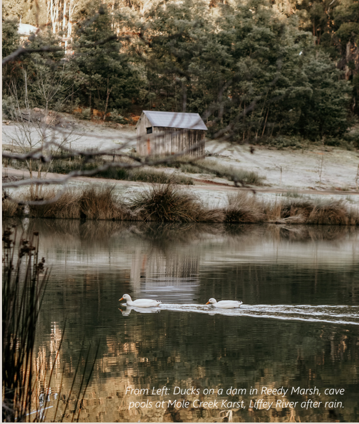
From Left: Ducks on a dam in Reedy Marsh, cave pools at Mole Creek Karst, Liffey River after rain.