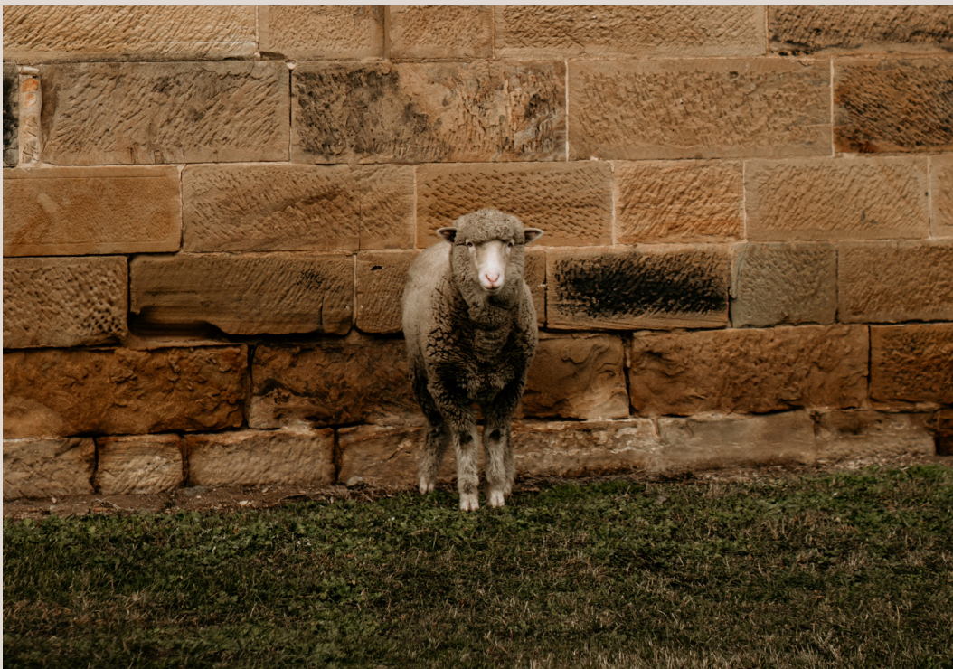
A lost sheep looking for a shepherd in Meander Valley