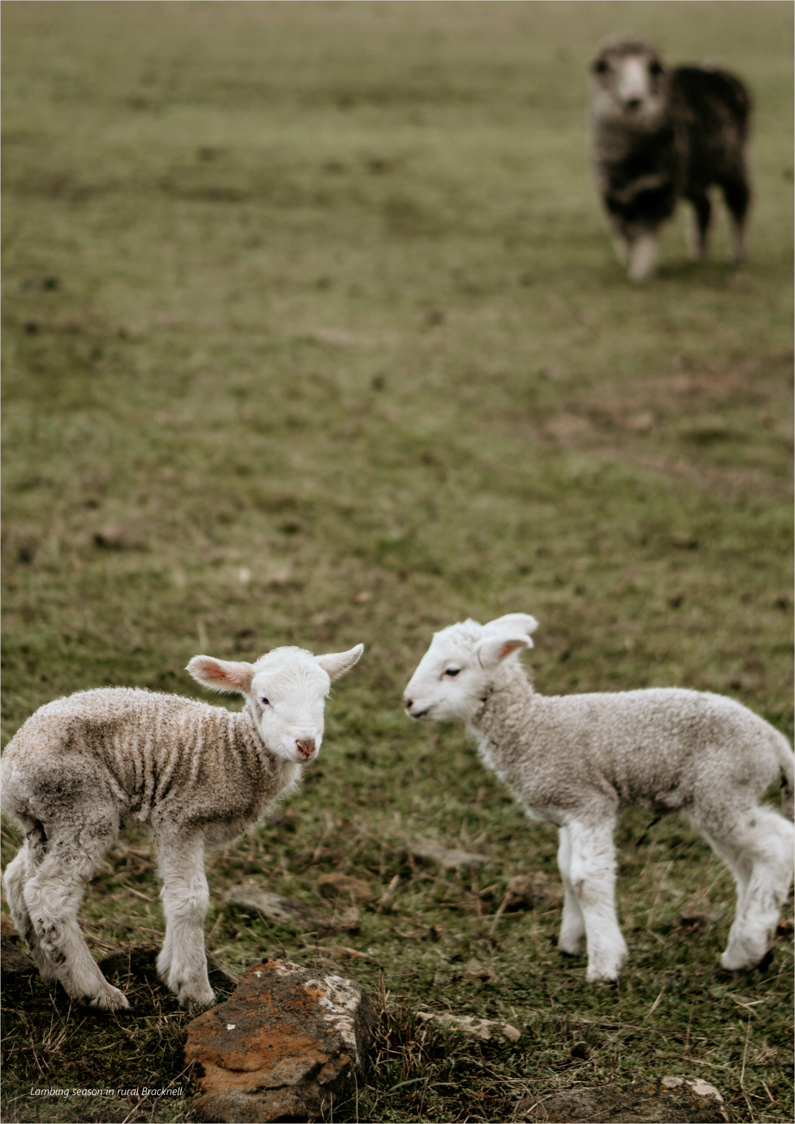
Lambing season in rural Bracknell.