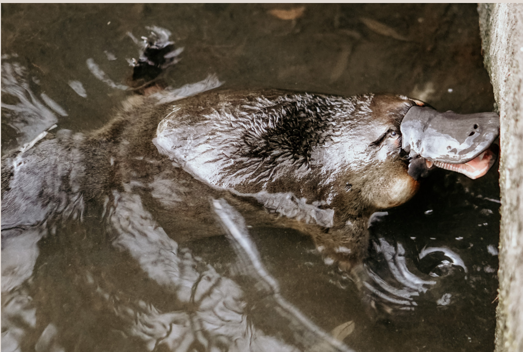
One of Deloraine's most famous residents: the platypus who makes his home along the banks of the Riverbank Reserve