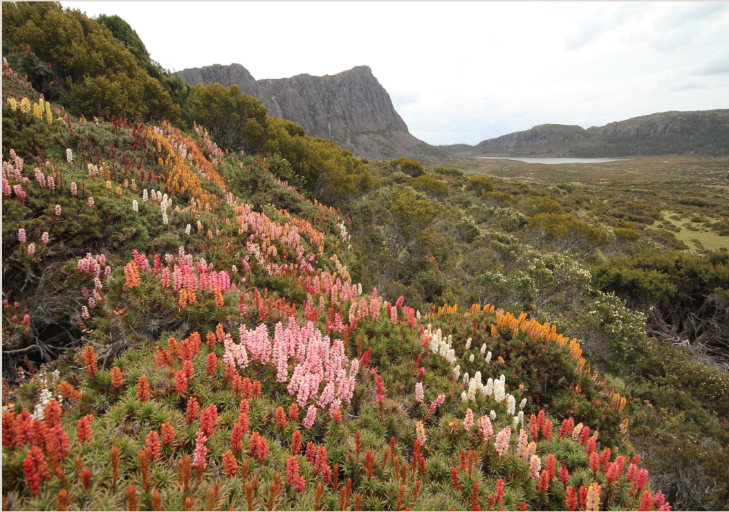
Springtime in Walls of Jerusalem National Park