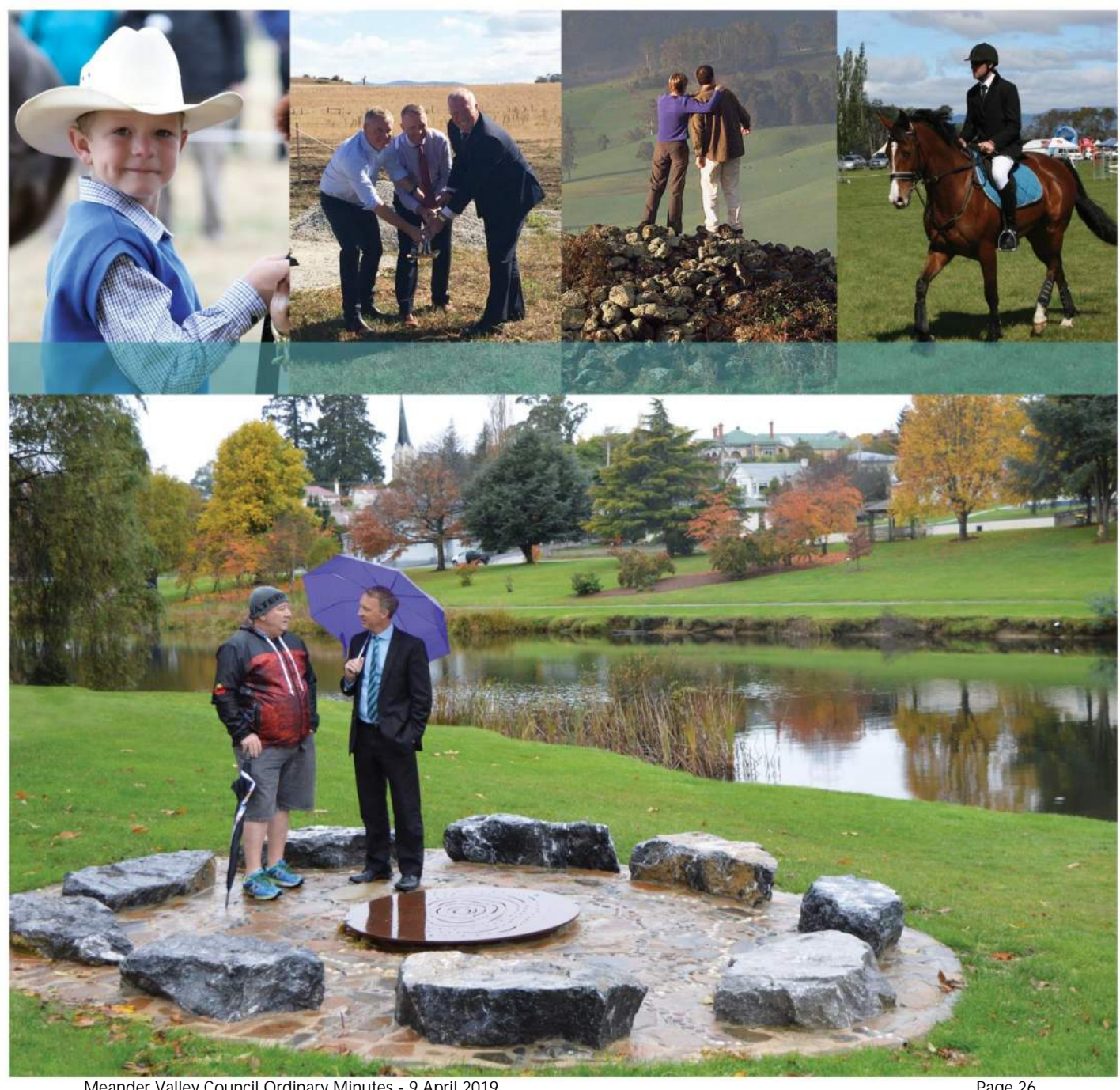
Meander Valley Council Ordinary Minutes - 9 April 2019