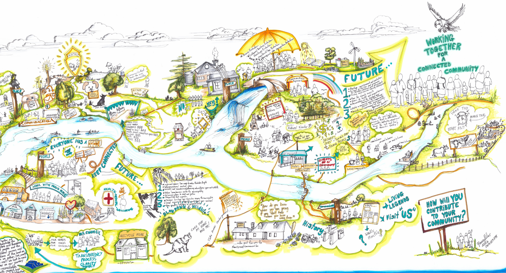
A snapshot of the 'graphic harvest' created by artist, Fiona Miller, during our in person Community Consultation Workshops.